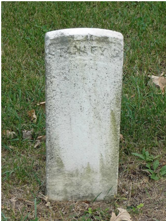
Marker for Stanley Sim, Wyoming Cemetery