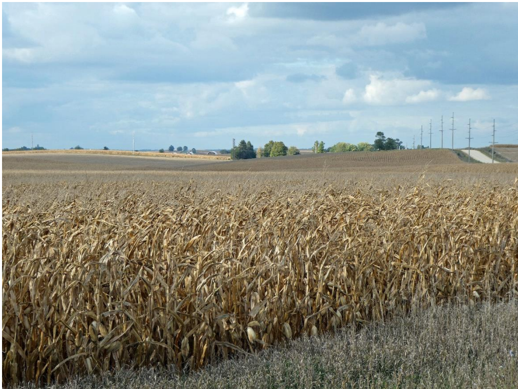
The part of the Sim-Wasson Farm that lies north across the road (Highway E29)