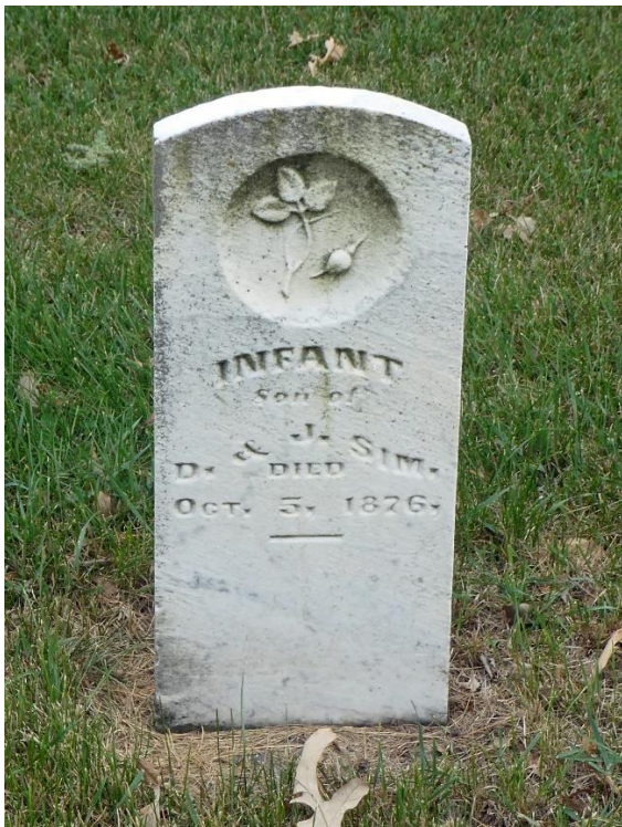
Marker for Stillborn Son Sim, Wyoming Cemetery

A son was stillborn on October 5, 1876. The child was buried in Wyoming Cemetery.